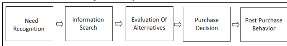
Figure 1 . Buyer Decision Process

information can come from personal sources such as from family, friends or from commercial sources such as advertisements, dealers, packaging, exhibitions and others. Based on the information that has been collected, consumers compare the choices that have been identified which can be done by comparing the choices of a product, consumers form beliefs, attitudes, and goals regarding the alternatives considered. Evaluation of alternatives is the next step before purchasing decisions where consumers try to find the best choice about the desired product by comparing it with different products and brands. Evaluation of alternatives at this stage of the buying decision process, is when consumers use information to evaluate alternatives in the choice set. The buying decision at this stage of the buying decision process, is when the consumer actually buys the product. Post-purchase behavior in the organizer of the buying choice handle, is when the buyer takes encouragement after buying activity based on fulfillment or disappointment. After the purchase decision is taken, the consumer will usually experience a level of satisfaction or dissatisfaction, because consumers have expectations of the product they have used. Post-purchase satisfaction will determine post-purchase actions of a product and will influence subsequent behavior, i.e. if the consumer is satisfied then he will show a higher probability of buying the product.